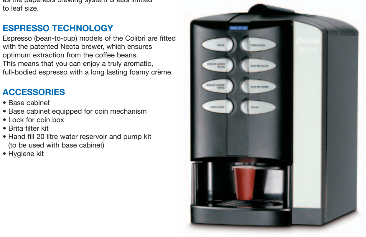
Leaf Tea model