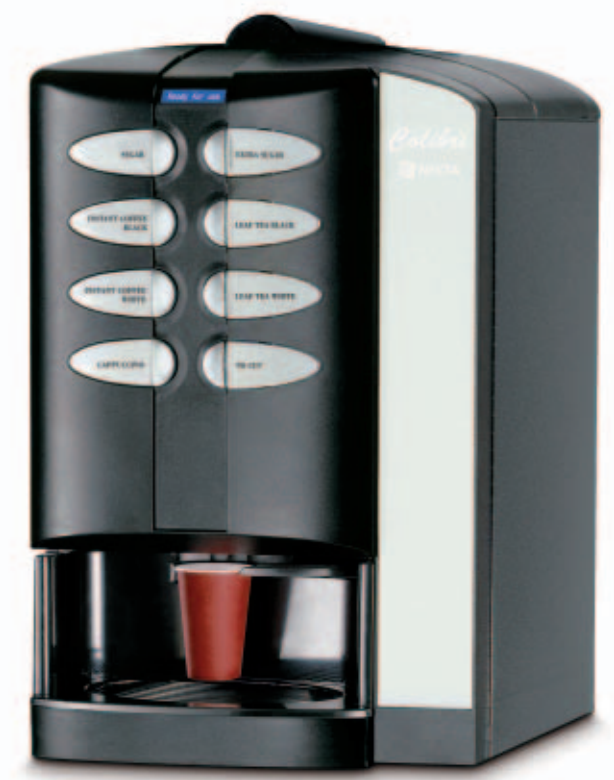
Leaf Tea model